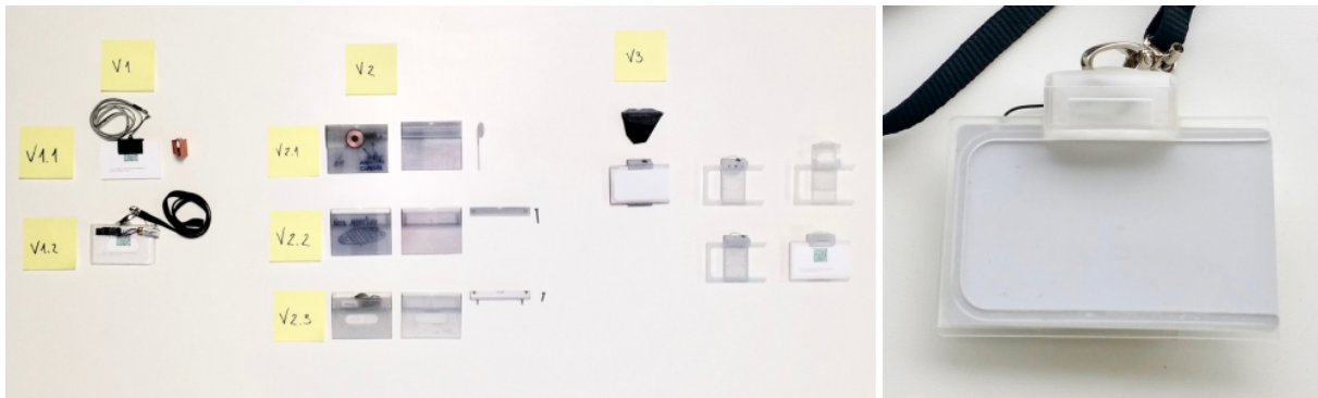
Figure 2: Previous iterations of the badge casing (left). Latest version (right).